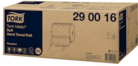
Tork Matic Soft HTR Prem 2p 100m 290016