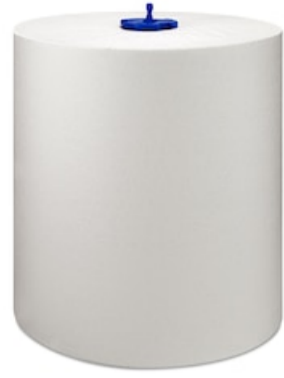
Tork Matic Extra Long HTR Univ 1p 280m 290059