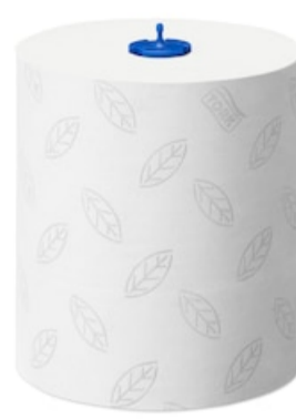
Tork Matic Soft HTR Adv 2p 150m 290067