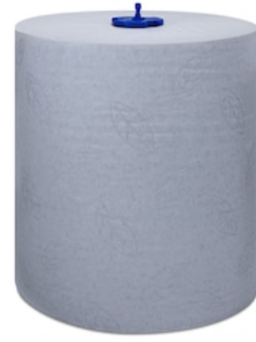
Tork Matic Blue HTR Adv 2p 150m 290068